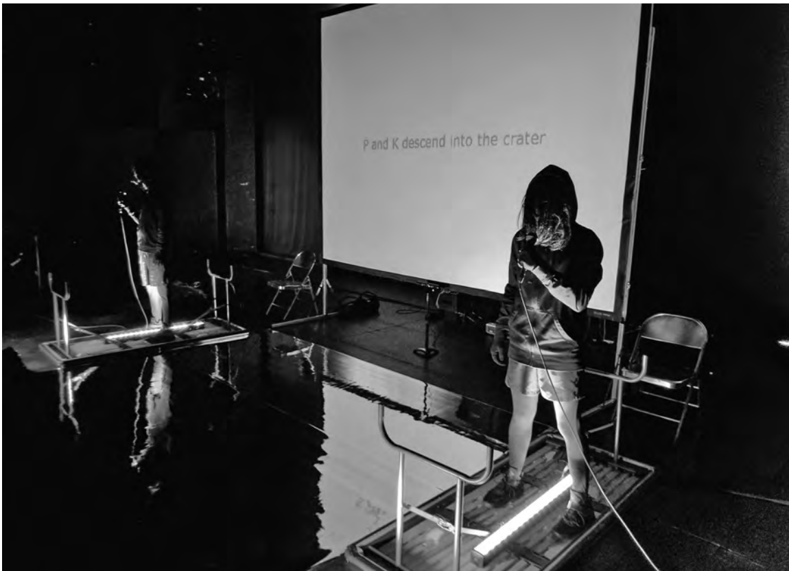
Opacity , 2017.

JOY, FACE WITH TEARS OF JOY, WINKING FACE, SMILING FACE WITH OPEN MOUTH, CHERRY BLOSSOM, BLUE HEART, SMIRKING FACE, WATER WAVE, HEAVY MINUS SIGN, SMILING FACE WITH SUNGLASSES, FACE WITH TEARS OF JOY, EYES, CHERRY BLOSSOM, BLUE HEART, FACE WITH TEARS OF JOY, WEARY FACE.